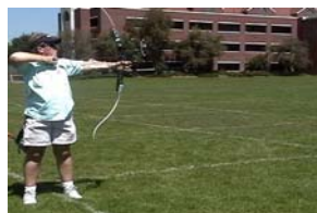
too much lead room