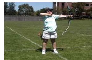
too little lead room