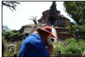
too much headroom