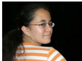
correct lead room

Lead Room - If you are interviewing someone or have video of someone talking, you generally do not want them looking directly at the camera (again, depends on your goals - certain situations may call for that). Generally you want the person to be looking off to the left or right of the camera a bit, towards where the interviewer is sitting. When you do this, frame your shot so that there is some lead room or talking room. That is, you want to leave some extra space to the side of their face as if you were going to draw a dialogue box in for them. If the person is talking to another person on camera, this is shown as space between them. If the person in motion, gives them space to walk to. It leaves space in the shot for the action, whether it be words or walking.