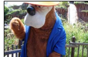
too little headroom

Lead Room - If you are interviewing someone or have video of someone talking, you generally do not want them looking directly at the camera (again, depends on your goals - certain situations may call for that). Generally you want the person to be looking off to the left or right of the camera a bit, towards where the interviewer is sitting. When you do this, frame your shot so that there is some lead room or talking room. That is, you want to leave some extra space to the side of their face as if you were going to draw a dialogue box in for them. If the person is talking to another person on camera, this is shown as space between them. If the person in motion, gives them space to walk to. It leaves space in the shot for the action, whether it be words or walking.